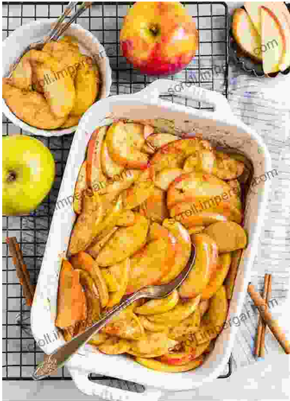
Savor honeyed apples, a treat symbolizing Brigid's sweetness.