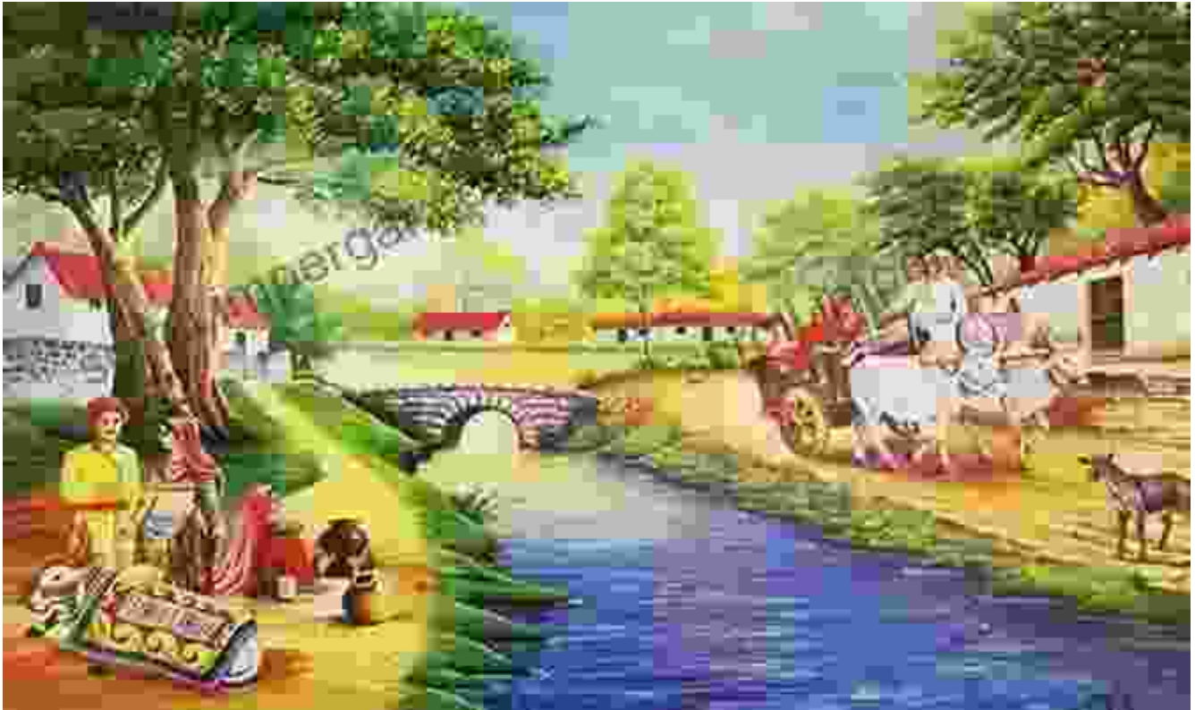
Caleb Umaru, "Emerald Embrace," Watercolor, 2023

Caleb Umaru's intricate watercolors delve into the heart of nature, capturing its vibrant colors and intricate details with astounding precision. His paintings transport us to hidden waterfalls, lush forests, and tranquil meadows, where every leaf and flower seems to whisper a tale. Through his masterful brushwork, he transforms the canvas into a living, breathing tapestry of nature's splendor.